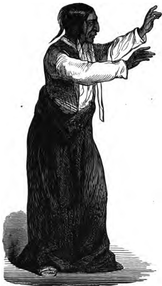
Red Cloud, the Orator Sioux Chief.