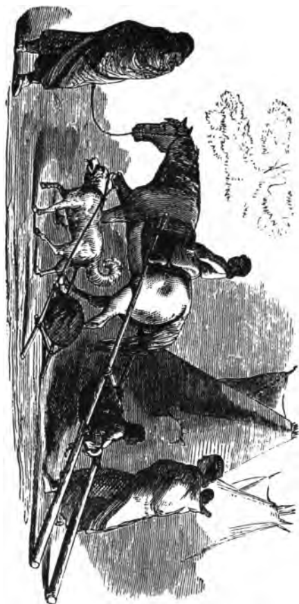
Indian Family on the Move.