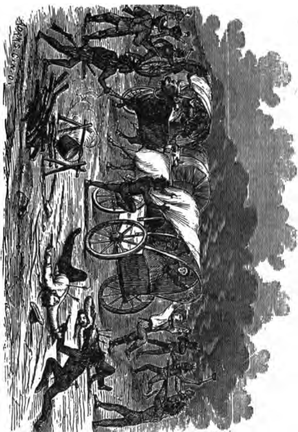
The Attack and Capture of Our Train, July 12th, 1864.