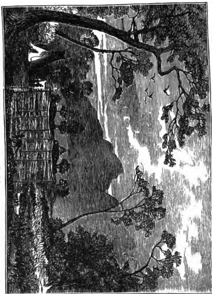
Mode of Indian Burial.