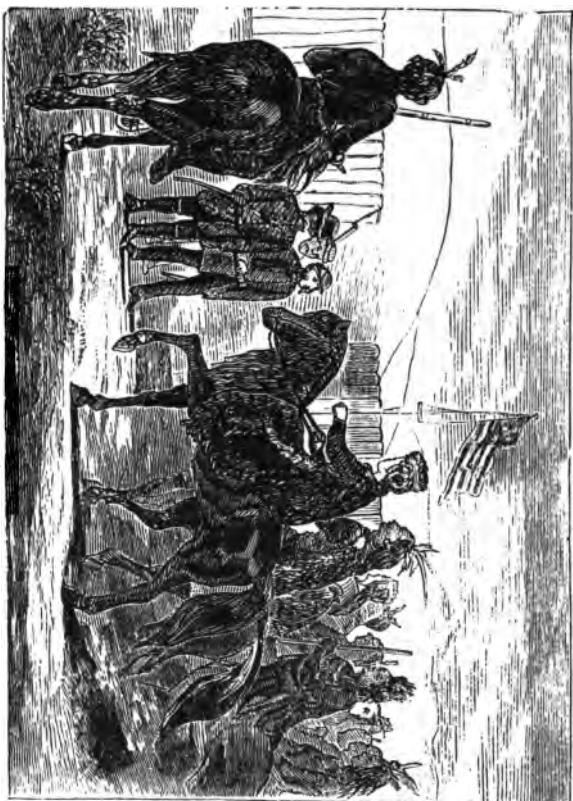
My Arrival at Fort Sully.