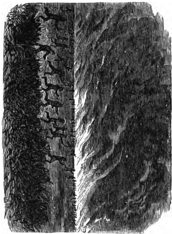
PRAIRIE ON FIRE.