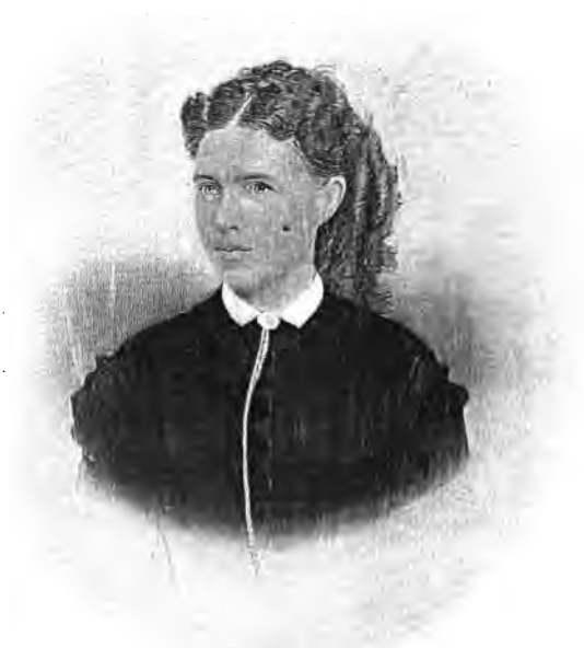
Charles F. Brown & Co. Chicago.